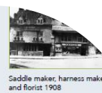
Saddle maker, harness maker and florist c. 1908